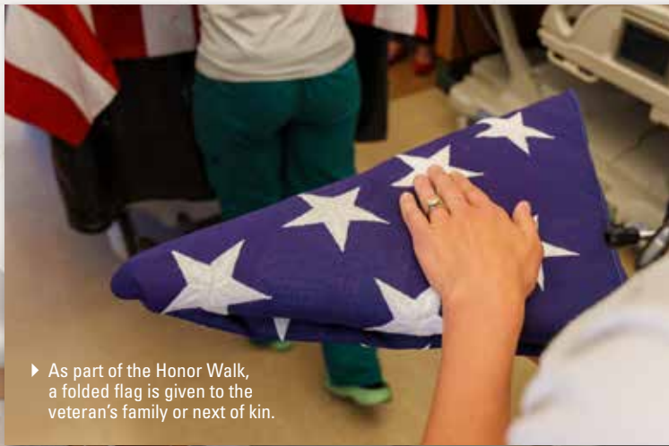
▶ As part of the Honor Walk, a folded flag is given to the veteran's family or next of kin.