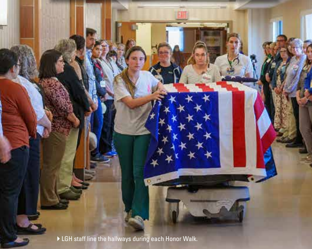
▶ LGH staff line the hallways during each Honor Walk.